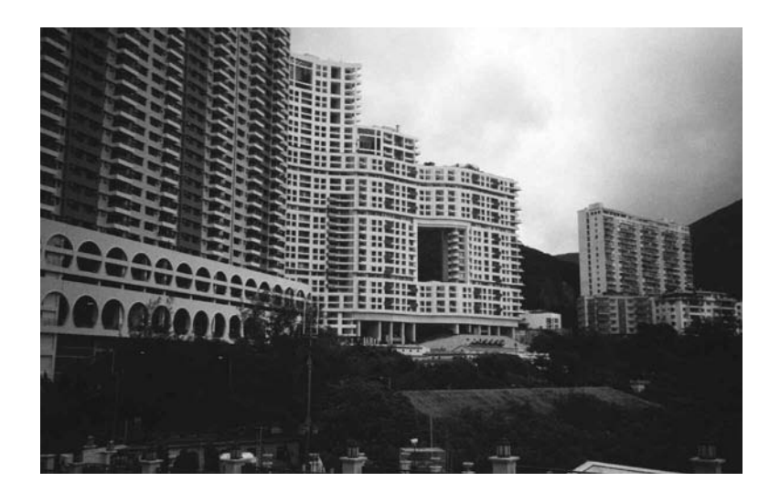
Hong Kong Housing.

Perhaps the ultimate machine symbol is the modern office building. It not only works like a machine but also sometimes assumes a machine aesthetic. There are no external variations of